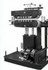
Rebuilt 24" Farris Catapuller Capstan

TAKE-UPS, PAY-OFFS, EXTRUDERS, CABLERS, TAPERS, PREHEATERS